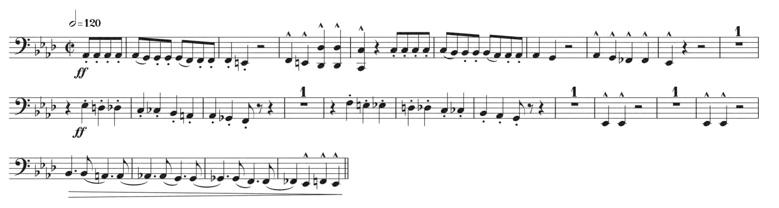
First Suite in E-flat for Military Band, Opus 28, No. 1 (Holst)